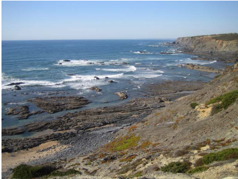
West coast of Portugal

Options for the PS-ICZM were assessed in two rounds (using the CDF). Three sets of strategic options were considered: thematic, institutional and a model of governance. For each set, three alternative options were assessed. The thematic options are outlined below.