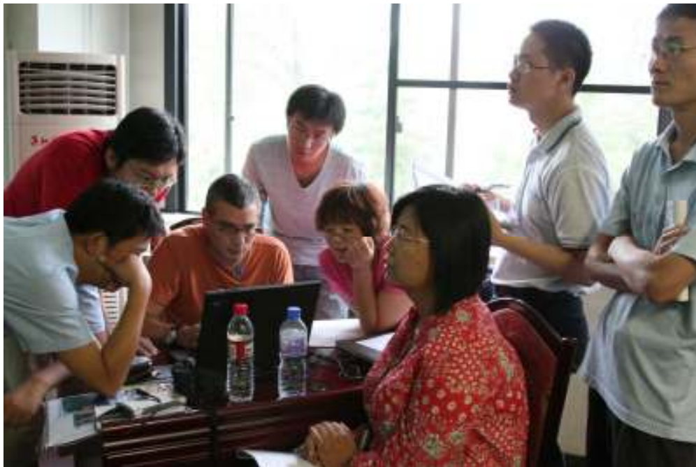
Picture 3: Discussion with the technical partners