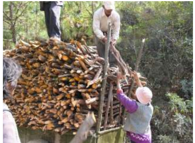
Picture 2: Logging activity in Baoxing Country